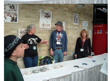
Here are some of our volunteers waiting for the next group of children