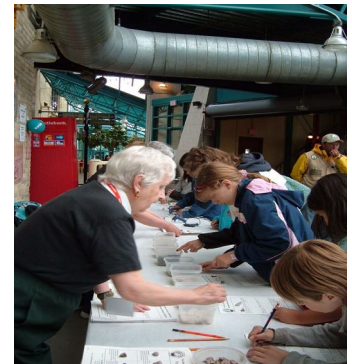
Glue cards got information as well as mineral or fossil samples

We had a busy 3 days with children and our glue cards.