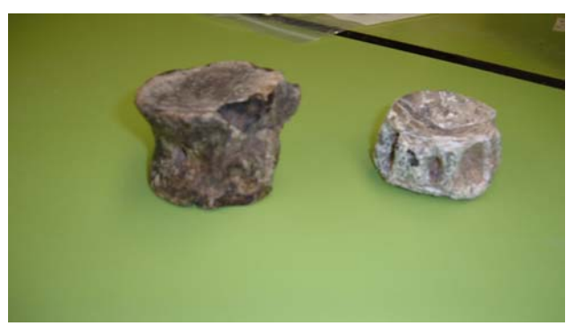
Mosasaurs and fish vertebrae. The fish would have bee over 6 feet long.

The minerals found there are: Bentonite, Jerosite, Siderite, and Gypsum. Marine fossils found here are: Mosasaurs, Pliosaurs, Plesiosaurs and various fish, some turtles, squid shark parts and birds. There were very few turtles found in Manitoba. Only the squid pins survived. Shark teeth and dermal denticles also known as placoid scales (tiny tooth-like structures) are found. Surprisingly, the birds still had their teeth.