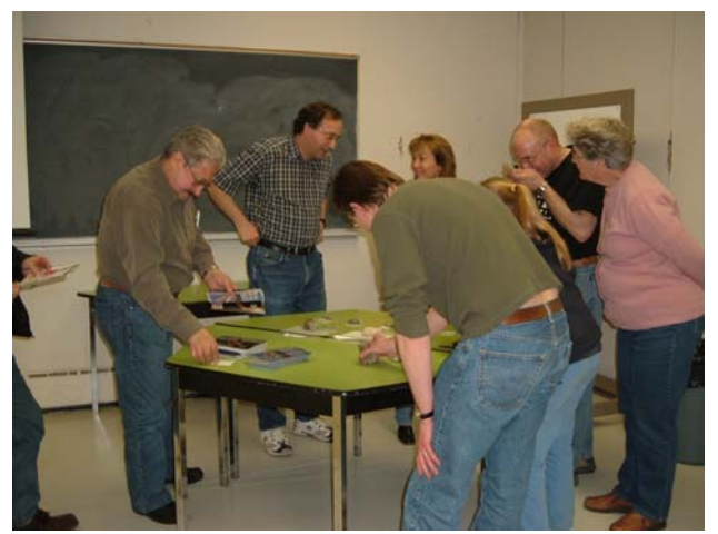
Fossil and rock samples being admired