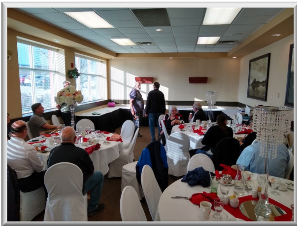
Picture above; Mineral Society members at event in Canad Inns, for the MSM dinner and live auction fundraiser.